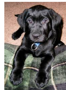
Mare (10/31/04) and Bayoni (10/28/05) Craig II (10/31/05) (Ben II x Pepper) (Zen x Happy II) (Baumann x Rochelle III)