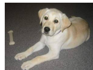
Enslow (11/2/05) Hermione (11/7/05) (Vector x Tenya) (Baumann x Takia)