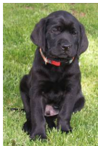
Lago (2/14/06) (Baumann x Yvonne II)