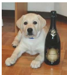
Korbel toasting in the new season.