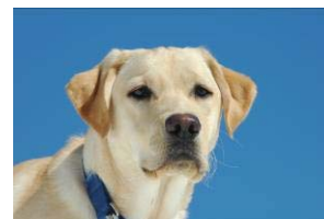
Cayo believes the bluest skies he's ever seen are in Seattle!