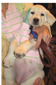
Heidi V (1/31/06) (Baumann x Senta)